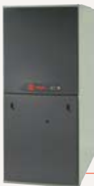
XV95 Furnace With Variable-Speed Motor and Comfort-R™

As part of our continuous product improvement, Trane reserves the right to change specifications and design without notice.